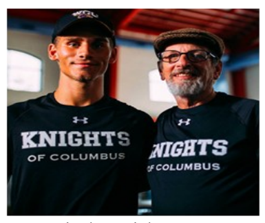
Join the Knights

Remember, long-term care policies are underwritten based on your health, and you most likely will never be any healthier than you are today.