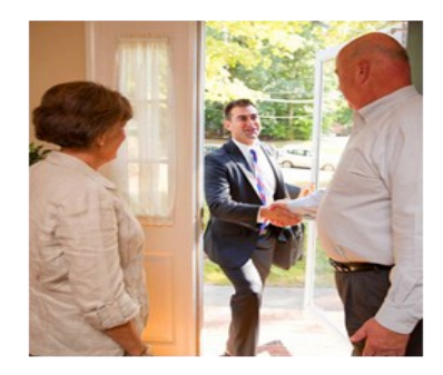
Find the Right Policy for You and Your Family